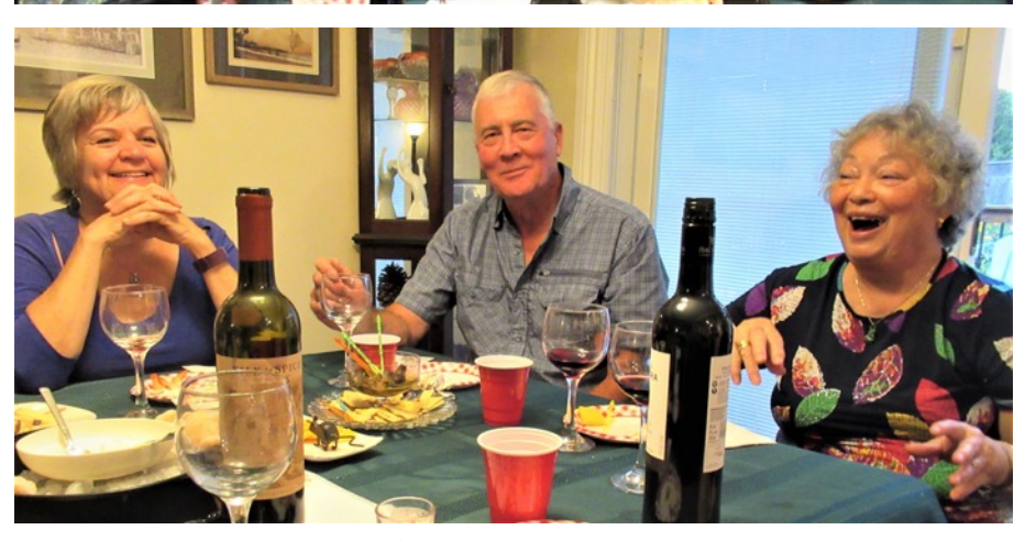
Getting into the spirit of things at the inaugural meeting of the Premiere Crew!