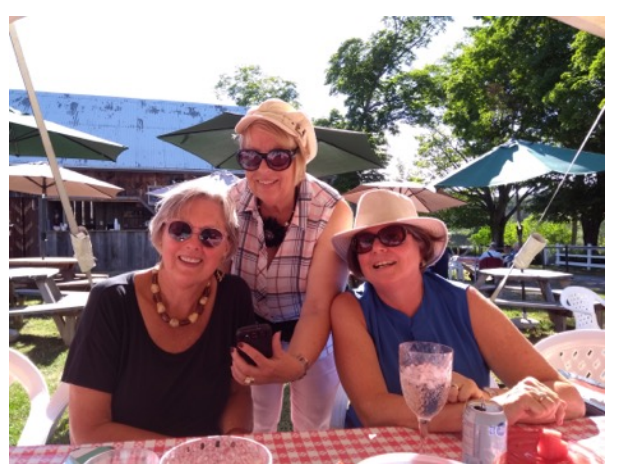
Enjoying the sun at the 4th Line Theatre.