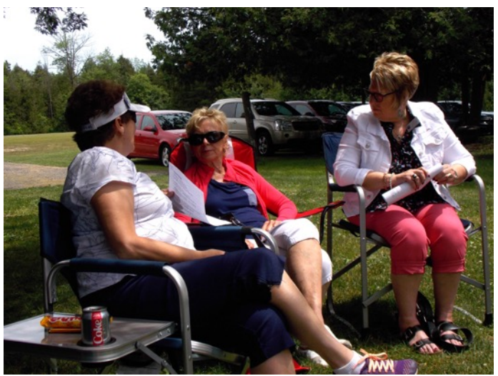
PROBUS Clarington members shared a picnic with members from the Oshawa club at the Hungarian picnic grounds.